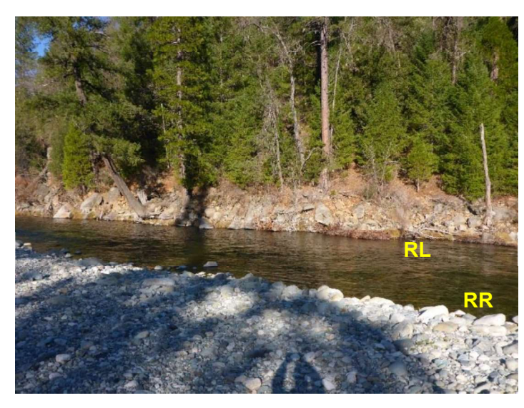
RR = River-Right RL = River-Left