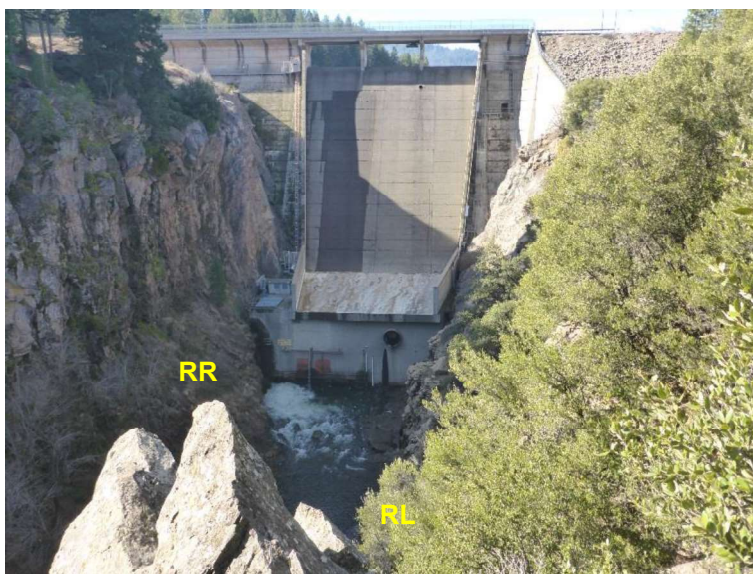
Box Canyon Dam