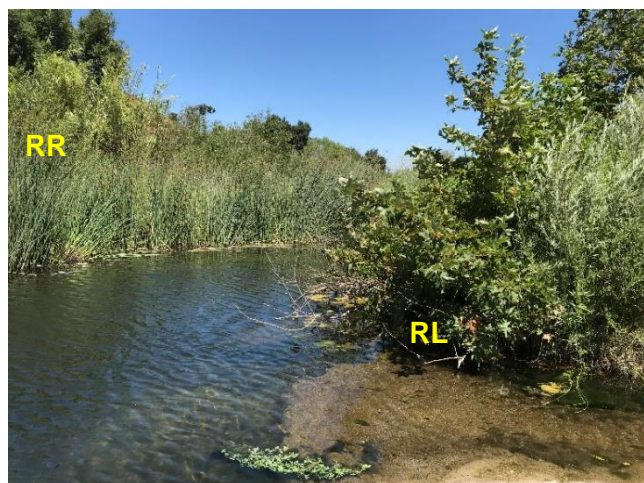
Upstream Murrieta Creek