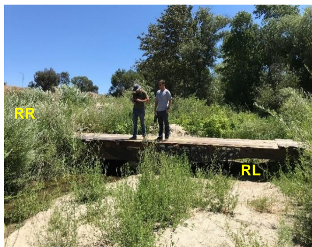
Upstream Temecula Creek