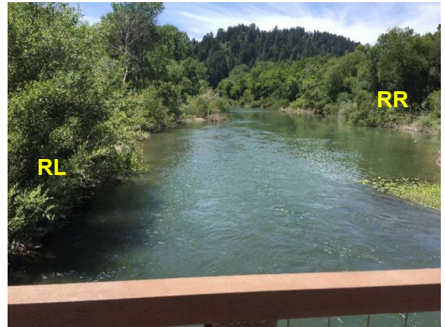
Downstream Photo Date: 06/06/2017