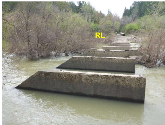
Entrance Photo Date: 03/15/2017