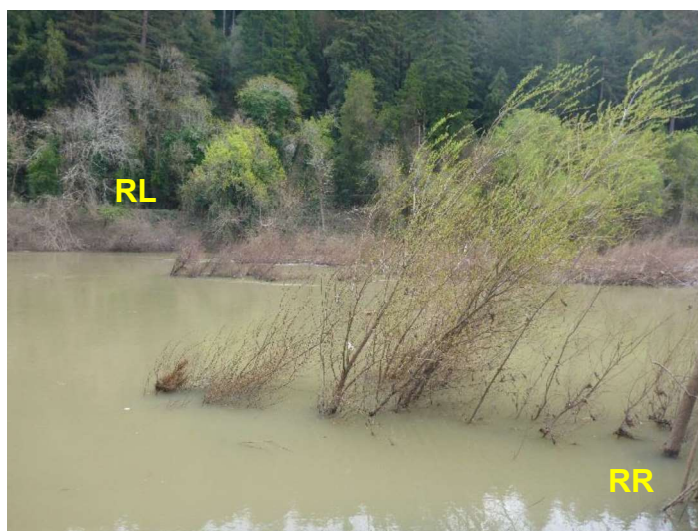
Straight Across Photo Date: 03/15/2017