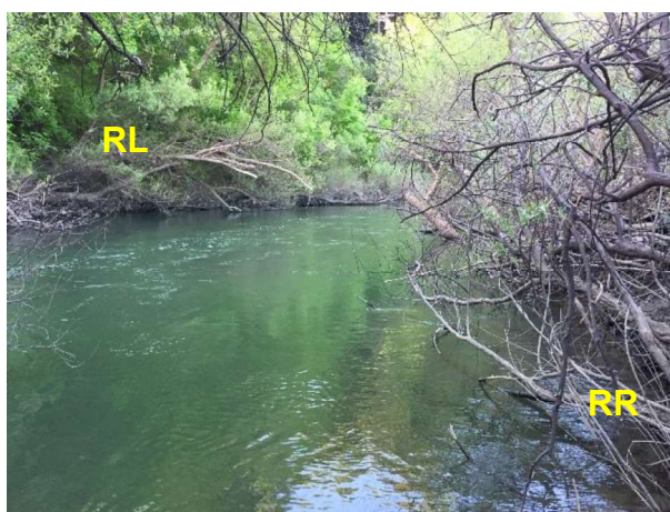
Downstream Photo Date: 05/01/2018