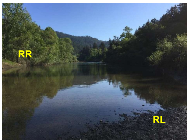
Upstream Photo Date: 05/01/2018