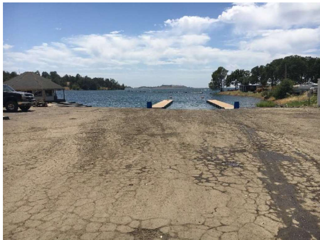
Marina Ramp Photo Date: 05/31/2018