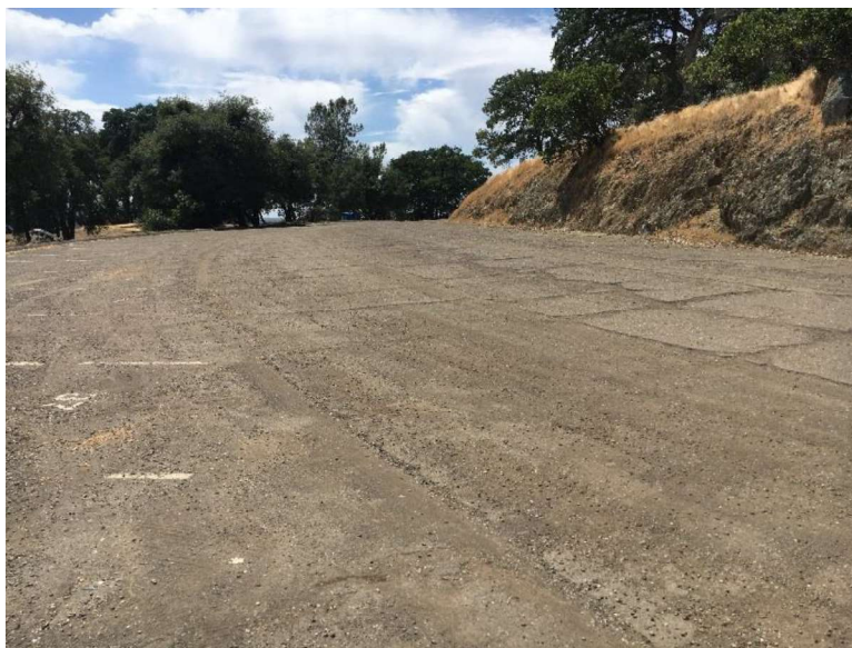
Staging Photo Date: 05/30/2018