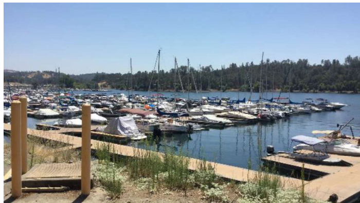
Marina Photo Date: 08/23/2017