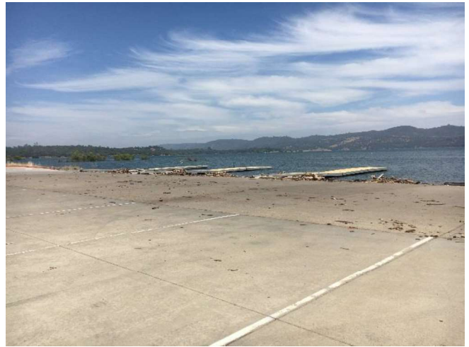
Lower Boat Ramps