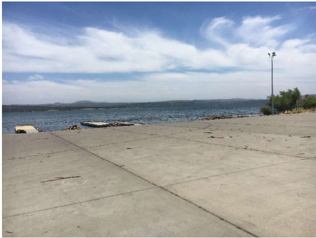
Upper Boat Ramps