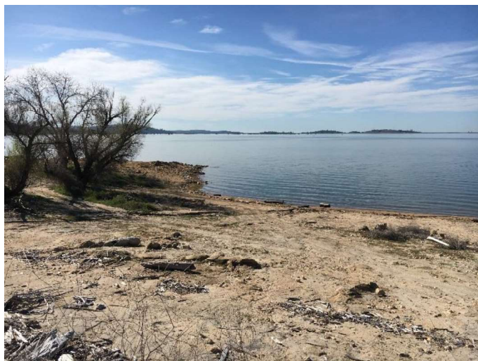
Doton Point Photo Date: 03/29/2018