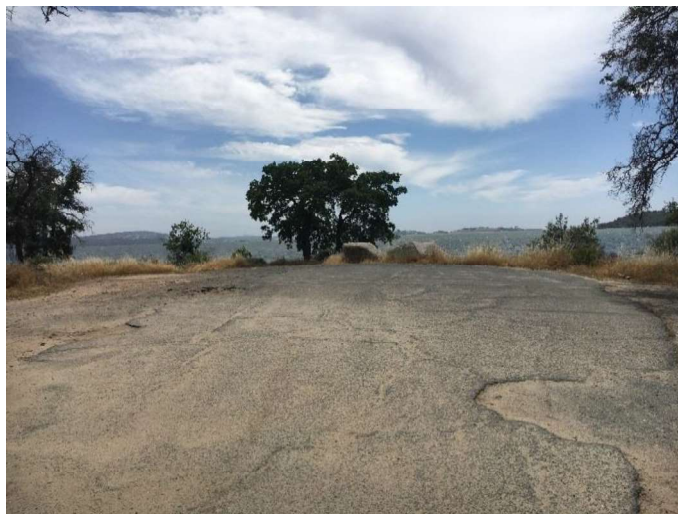
Oak Point Photo Date: 05/30/2018