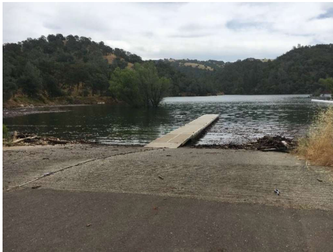
Boat Ramp Photo Date: 05/30/2018