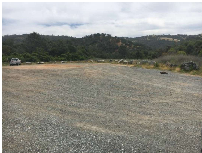
Additional Staging Photo Date: 05/30/2018