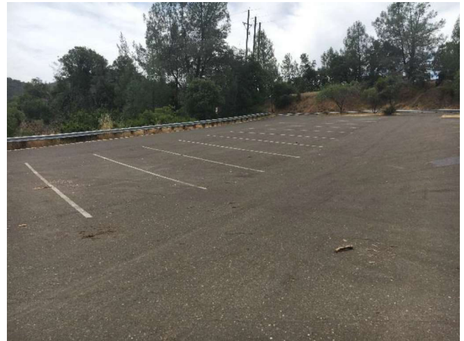
Staging Photo Date: 05/30/2018