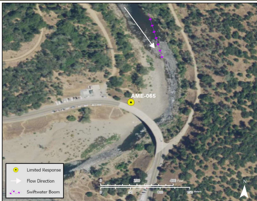
Table of Response Resources