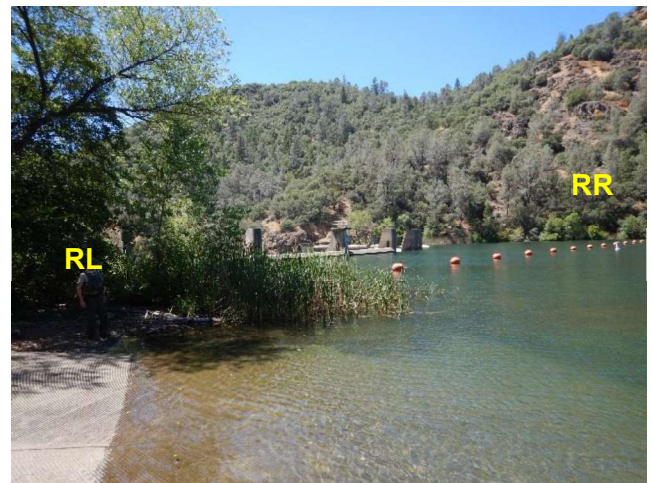
Downstream Photo Date: 06/29/2016