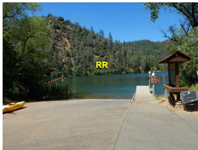
Straight Across Photo Date: 06/29/2016