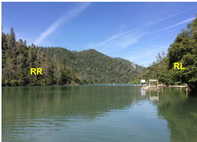
Upstream Photo Date: 05/11/2018