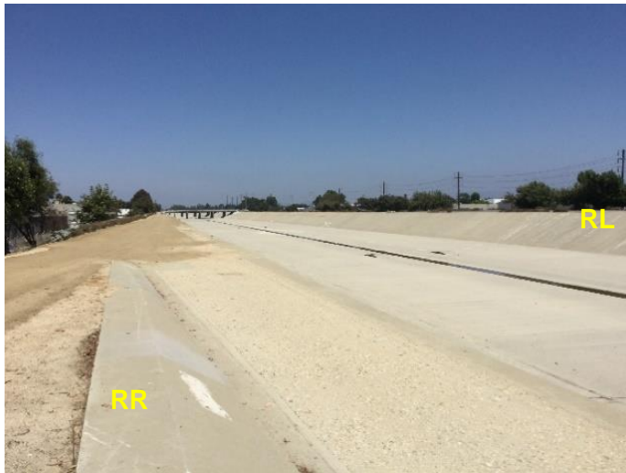
Upstream Photo Date: 8/23/2019