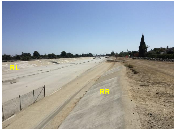
Downstream Photo Date: 8/23/2019