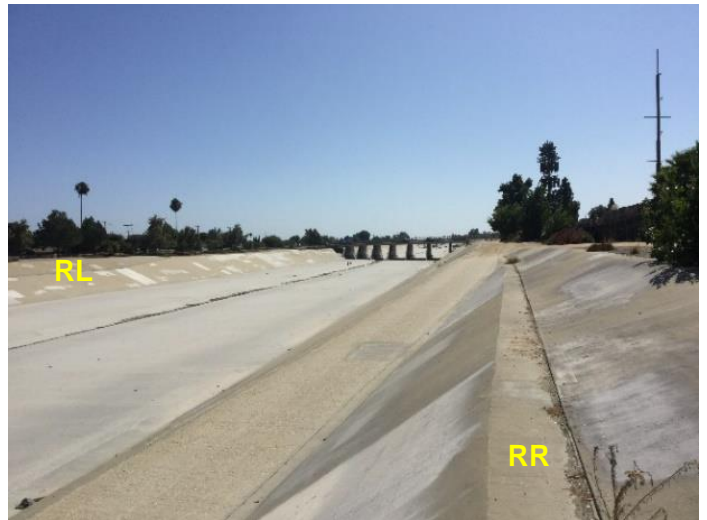
Downstream Photo Date: 8/23/2019