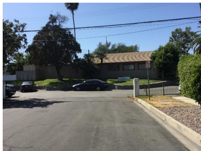
Entrance Photo Date: 8/23/2019