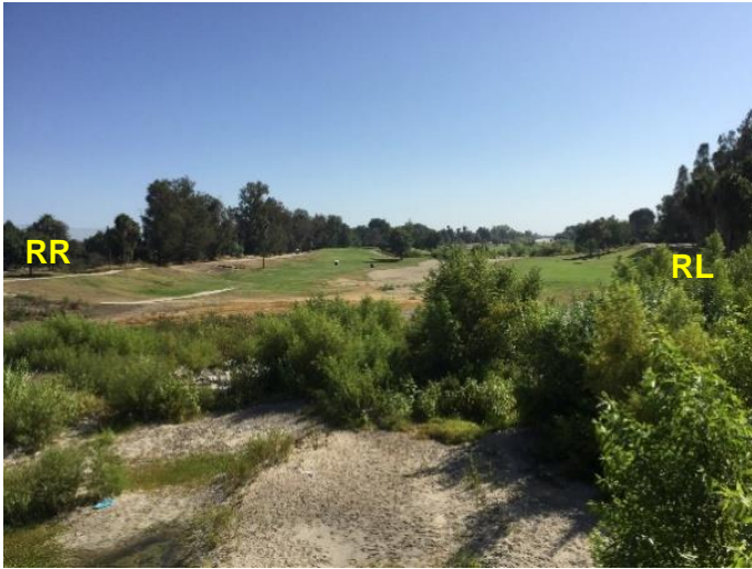
Upstream Photo Date: 8/23/2017