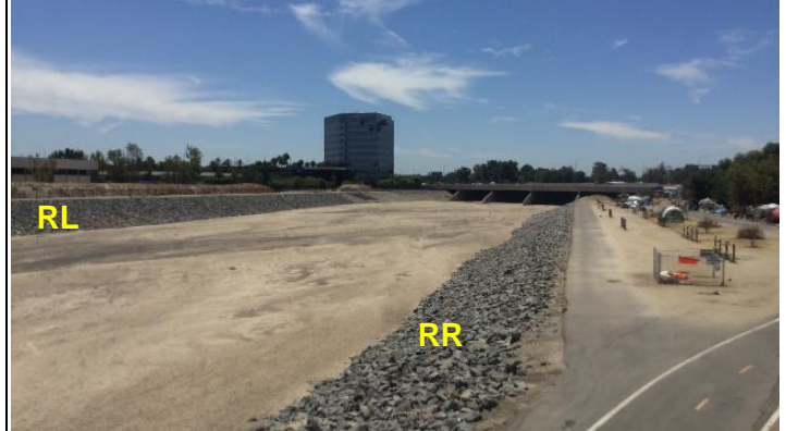
Downstream Photo Date: 8/23/2017