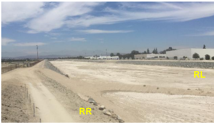
Upstream Photo Date: 8/23/2017