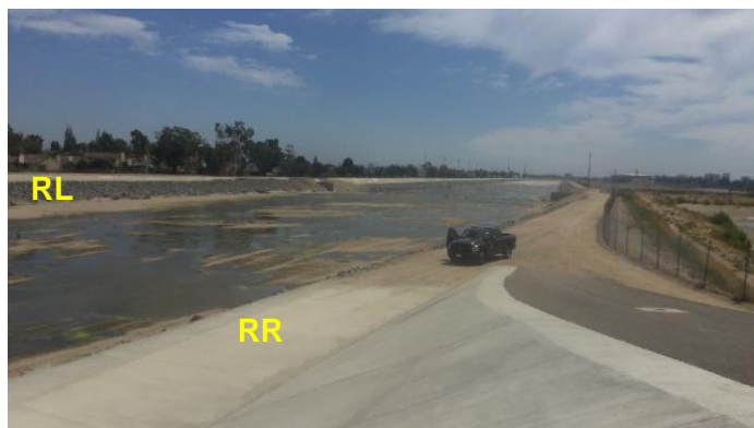
Downstream Photo Date: 8/23/2017