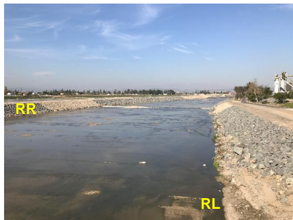
Upstream Photo Date: 2/13/2020