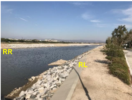
Upstream Photo Date: 2/13/2020