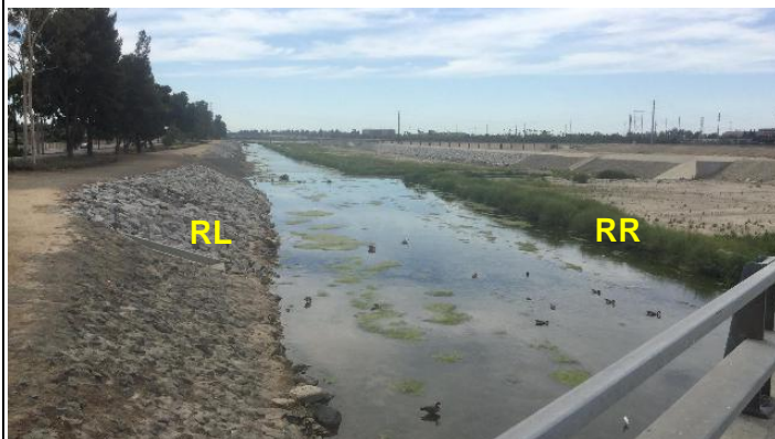
Downstream Photo Date: 8/23/2017