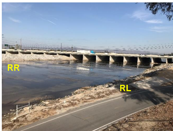
Upstream Photo Date: 2/13/2020