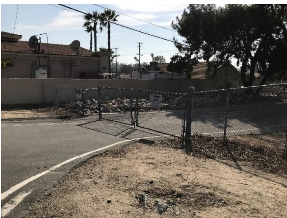
Entrance Photo Date: 2/13/2020