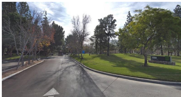
Entrance Photo from Google Maps