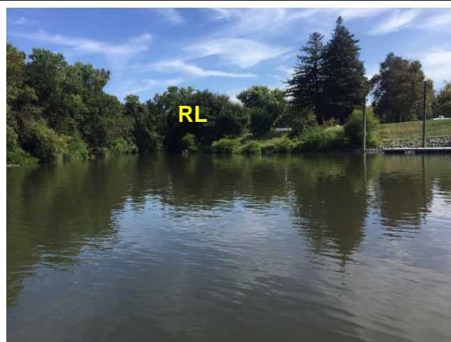
Boat launch area