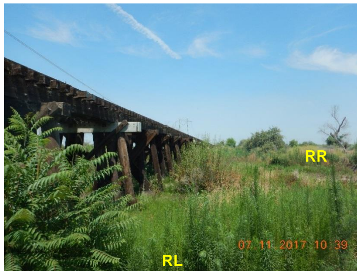
Straight Across Photo Date: 07/11/2017