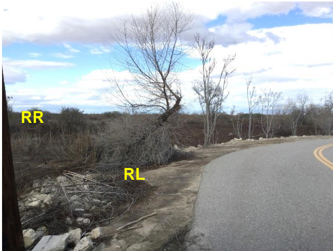
Upstream Photo Date: 03/01/2018