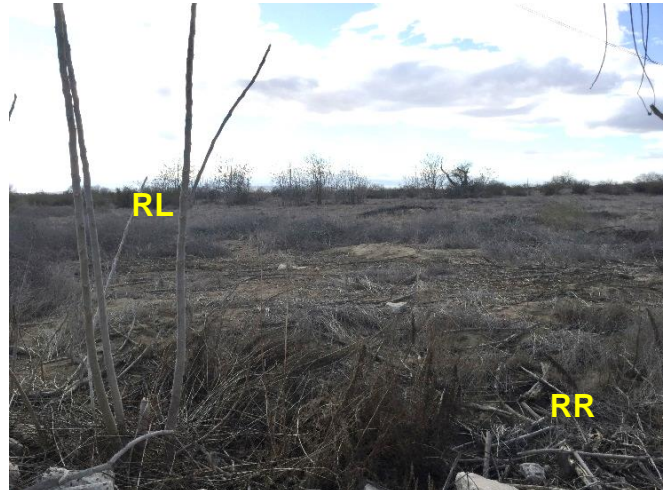
Downstream Photo Date: 03/01/2018