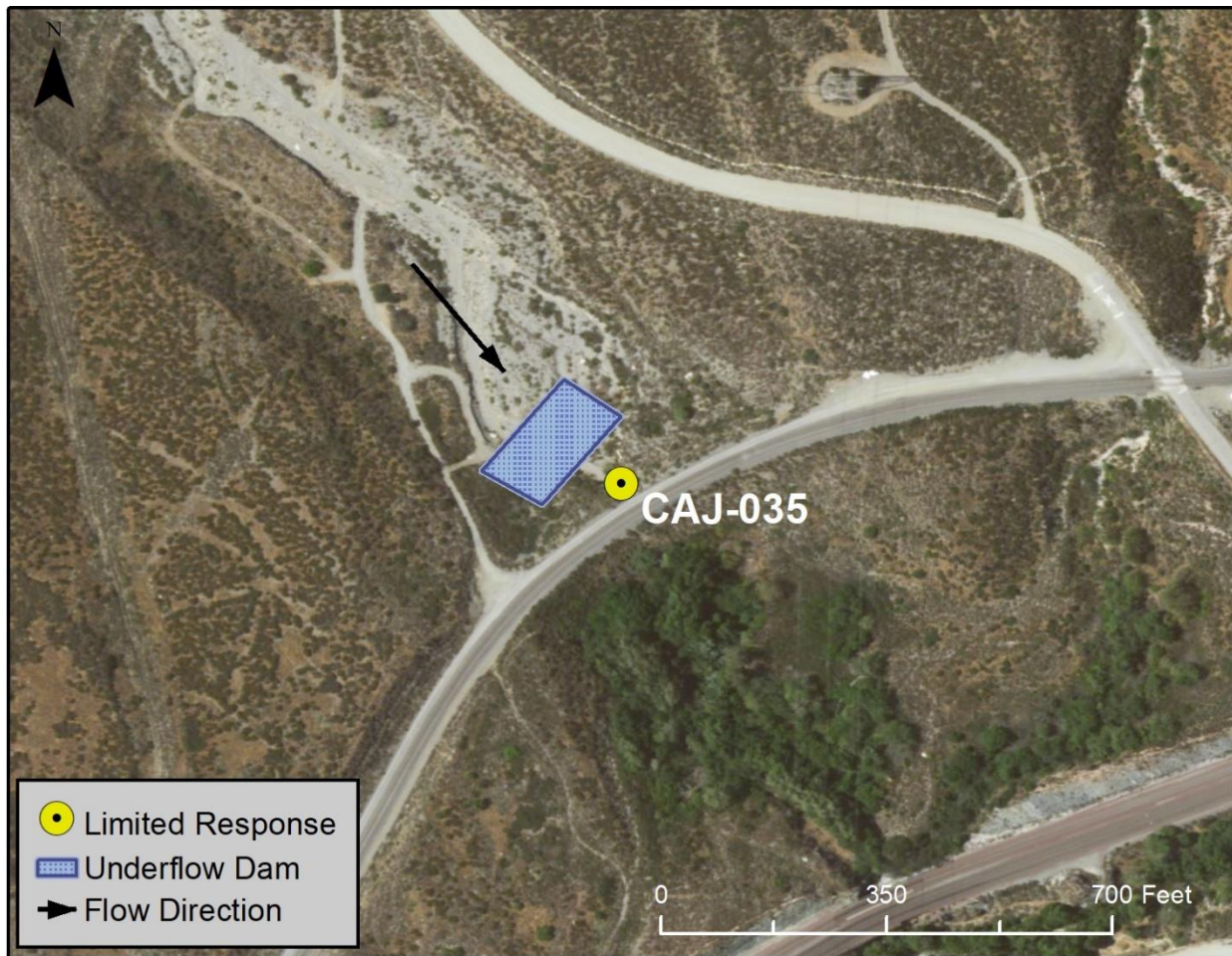
Table of Response Resources