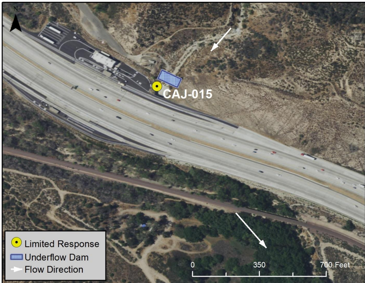
Table of Response Resources