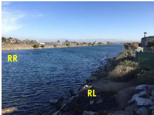
Upstream, Photo Date: 03/27/2017