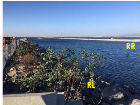
Downstream, Photo Date: 03/27/2017