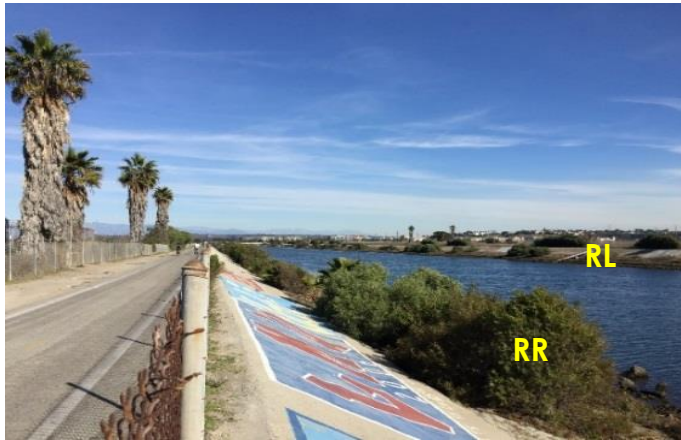
Upstream, Photo Date: 1/21/2018