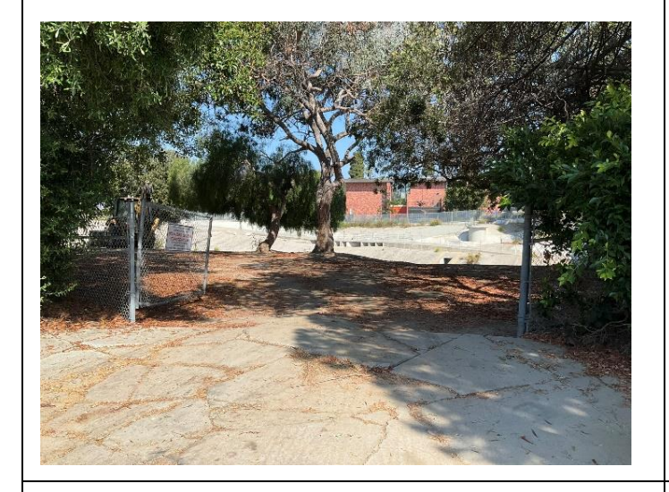
RR = River Right RL = River Left