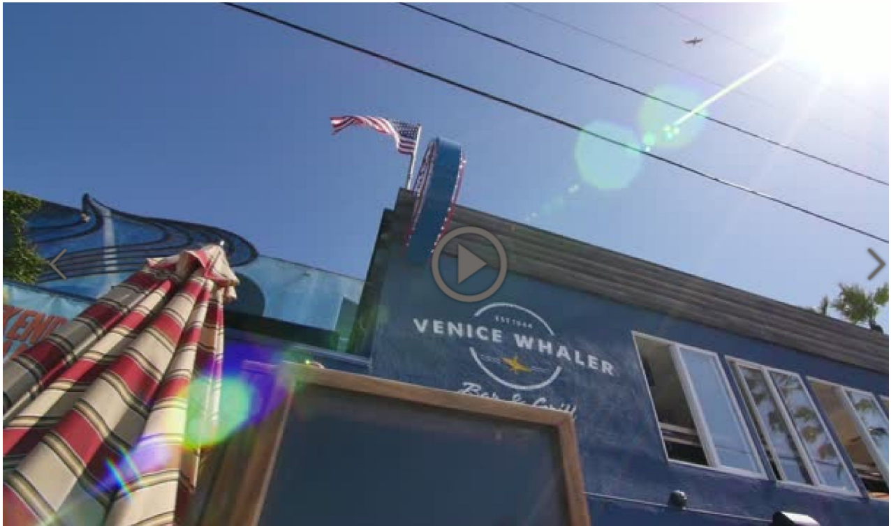
14 Mast Drone video