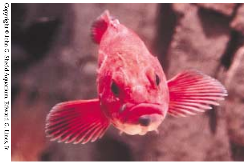
The yelloweye rockfish ( Sebastes ruberrimus ) has very low productivity and has virtually disappeared from recreational catches in Puget Sound.

Status by DPS: Vulnerable, w. Atlantic 90% decline (Castro et al. 1999), bycatch mortality high in long-line fisheries.