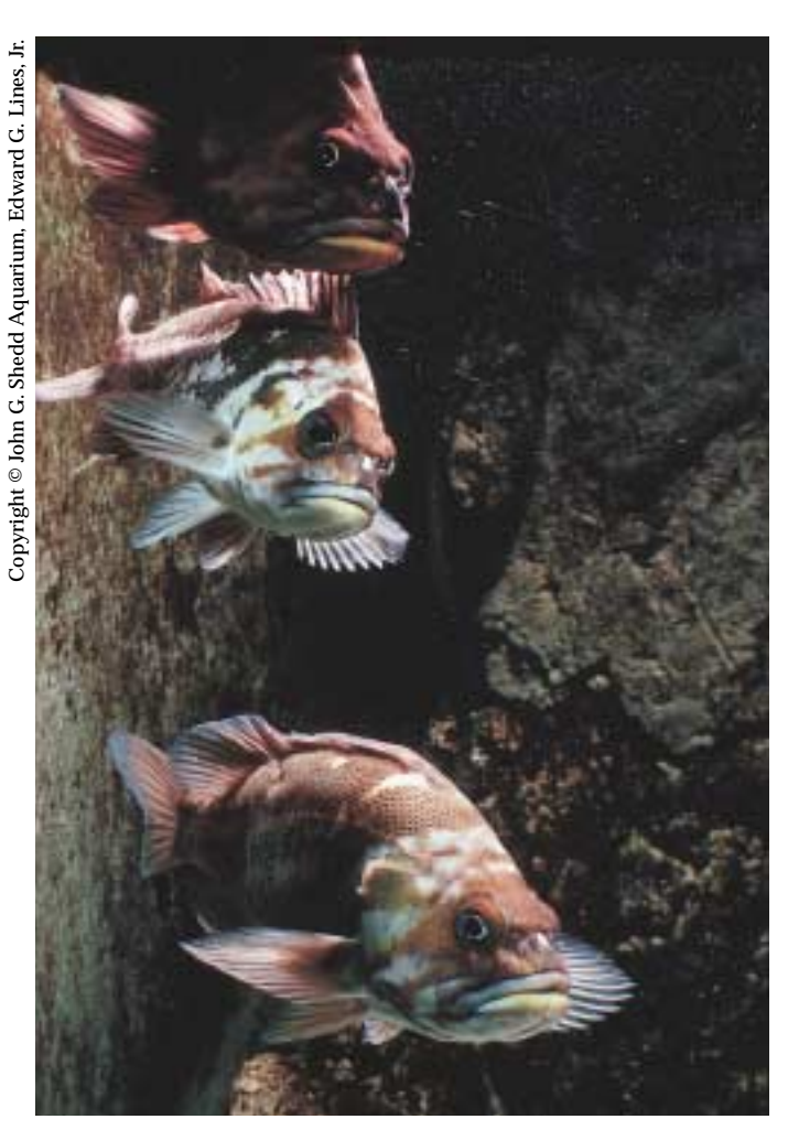
Very low productivity is one factor in classifying the copper rockfish ( Sebastes caurinus ) as vulnerable in Puget Sound.

DPS in Canada: Endangered, 33 interior Bay of Fundy rivers from St. Johns R., NB, to Annapolis R., NS (population declined from 40,000 in mid-1980s to a few hundred in 1999), NS e. and s. rivers (populations extirpated in 14 rivers, acid rain and water quality problems); threatened, St. Croix R. to St. Johns R., NB; vulnerable, Miramichi R.; not at risk, Restigouche R., NS, Northumberland Strait and Cape Breton Isl., most rivers in NF and PQ; not assessed, Labrador (ASF 2000; DFO 2000).