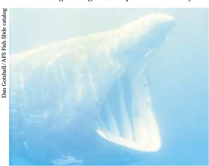
The basking shark ( Cetorhinus maximus ) is classified as vulnerable in the Pacific and conservation dependent in the Atlantic.

Risk Factors: Largest living fish, with probable low to very low