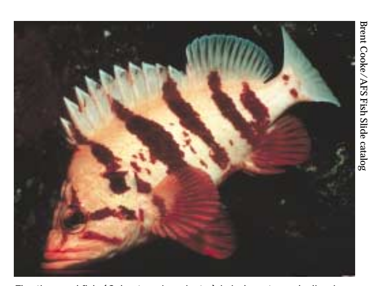
The tiger rockfish (Sebastes nigrocinctus) is in long-term decline in Puget Sound.

Risk Factors: Habitat destruction and alteration of spawning and nursery areas, dams, logging, agricultural water diversions. Official Status: None, U.S.; special concern, CA (website analysis suggests severely endangered) (CA Department