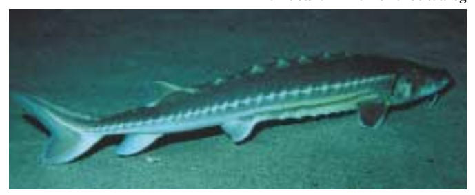
The rare green sturgeon ( Acipenser medirostris ) is endangered in California and Oregon.